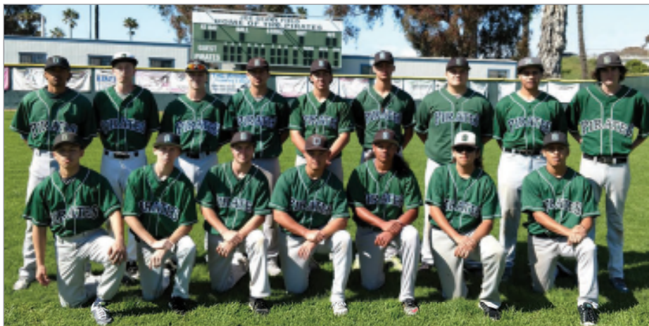
The Oceanside High School Pirate baseball team.